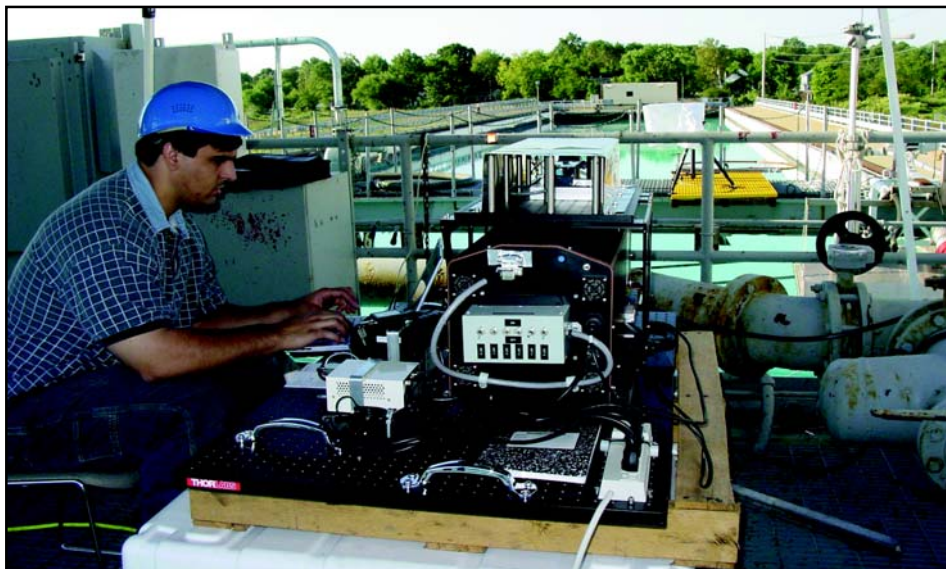
An engineer from SESI fine-tunes their fluorescence LIDAR system prior to a test.

In addition to testing during the day, night testing was conducted to test the fluorometer's ability to detect oil at night.