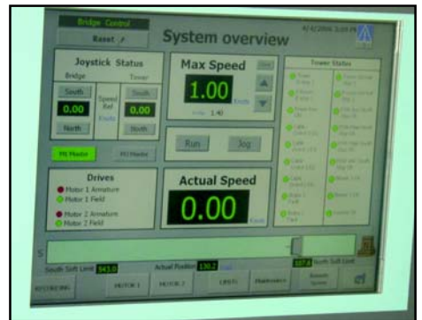
The new bridge drive system includes a computerized system so the tank’s bridges may now be controlled and operated from both the control tower and the main bridge.