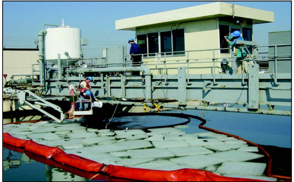
Using ice grown at CRREL, engineers and technicians created an ice field in the Ohmsett tank to conduct Oil Herding Surfactant research at full-scale.

Using ice grown at CRREL, engineers and technicians created an ice field in the Ohmsett tank to conduct an identical test at large-scale. With realistic conditions of currents and wind on the test basin, a small boom was placed in the ice field and filled with oil. The boom was then lifted to release the oil into the ice field. An oil herding surfactant was then applied around the perimeter of the ice field to thicken the oil slick.