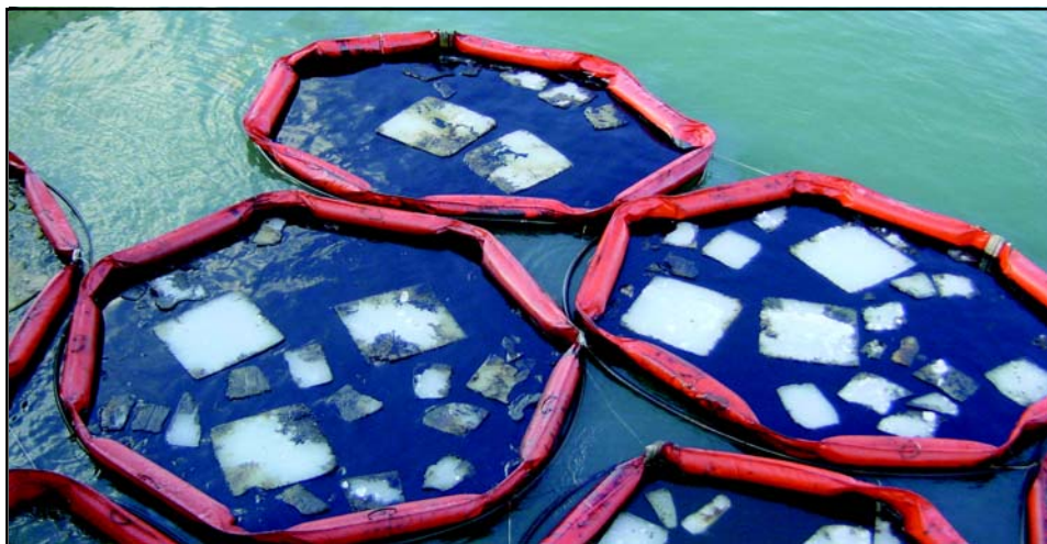
During the empirical oil weathering experiment, large blocks of ice were brought to Ohmsett so researchers could measure oil evaporation, spreading and dispersion in and on ice.

In the 1970s and 1980s, the Minerals Management Service (MMS) Alaska Regional Office conducted field work to test the physics for oil weathering in ice to develop oil spill response models. MMS conducted further lab research with low viscosity and low pour-point oils in the late 1980s and 1990s. It is a recognized fact by the researchers that oil weathering is strongly dependent on the specific chemical composition and characteristics of individual crude oils.