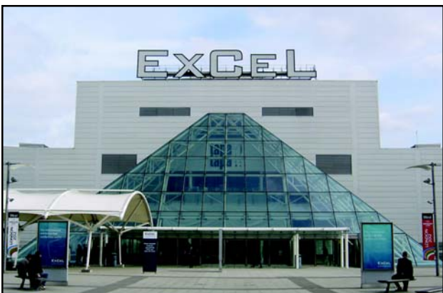
The ExCeL Centre, London Docklands was the site for the Interspill 2006 Conference and Spill 06 International Exhibition.