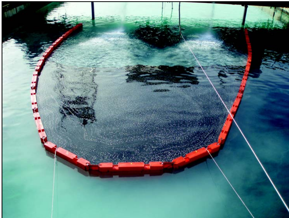
Oil is contained in Oil Limited's rigid boom system during boom performance testing at Ohmsett in January 2006.

oil at a significant depth," Fisk explained. "When oil is transferred in the contained area, it will compact the oil to the full depth of the boom."