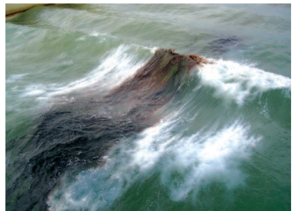
Dispersant effectiveness testing