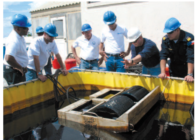
Responders learn spill response technologies and strategies

Our training facility includes a classroom that can accommodate up to 25 students, with state-of-the-art audio-visual equipment where you can conduct interactive sessions to complement the tank exercises. Training is conducted by leading specialists in hazardous material spill response.