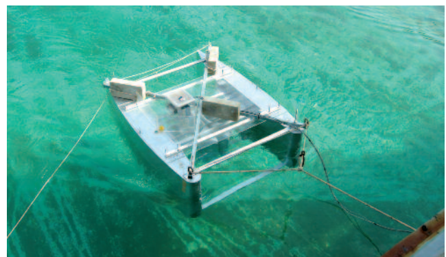
Marine renewable energy device and system testing