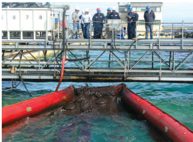
Hands-on oil spill response training using full-scale equipment and techniques