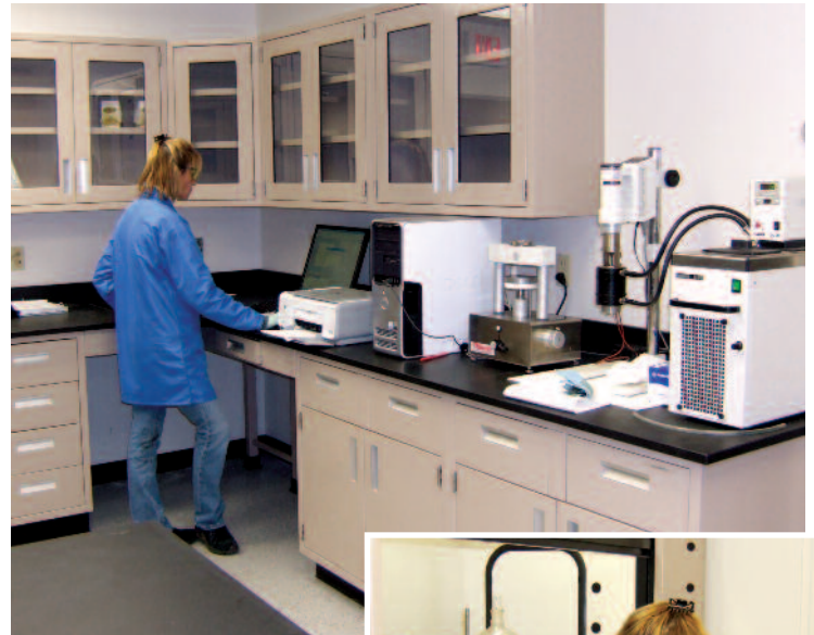
On-site Chemistry Lab

Only a full-size facility can give you the most accurate and reliable results. From sorbents, chemical treating agents and dispersants to containment booms, skimmers, pumping systems and temporary storage devices – you can test them at Ohmsett.