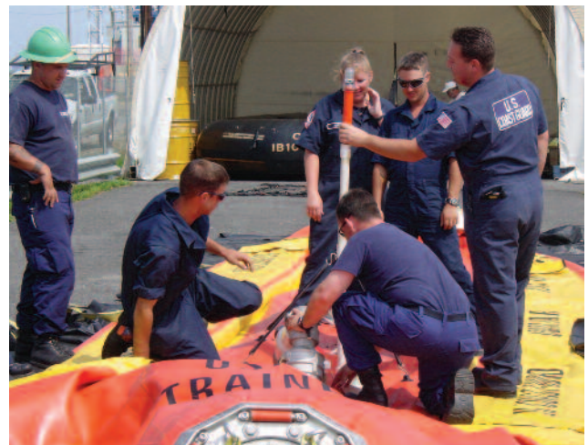
U.S. Coast Guard training includes oil spill recovery and ancillary systems operation