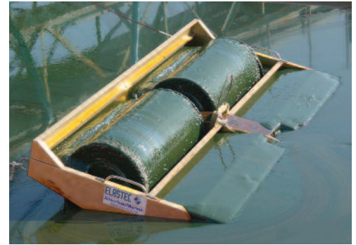
Skimmer protocol development