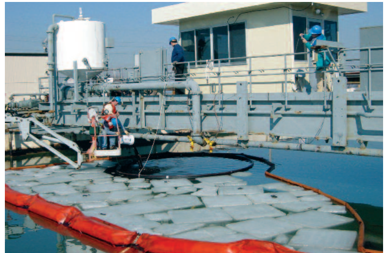
Oil in ice testing